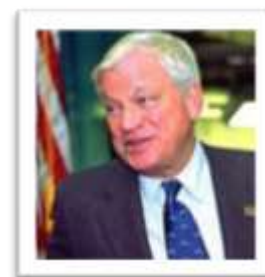
Richard Mellon Scaife Publishing and Oil Billionaire