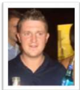
Stephen Yaxley-Lennon Aka 'Tommy Robinson'

The opportunity to connect to natural street fighters of the white working class emerged when Stephen Lennon set up a website to promote the pro-soldier/anti-Islamist protest group United People of Luton: