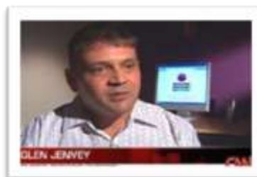
Sri Lankan journalist