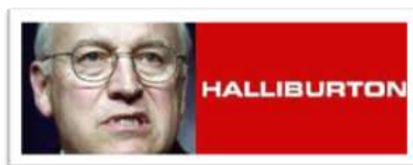
Former Halliburton CEO Former US Vice-President Dick Cheney

Of course, the 'Kings' today don't wear crowns, but a Dick Cheney as CEO of a giant corporation such as Halliburton 18 controls wealth and hidden power beyond the wildest dreams of a Henry VIII or a Louis XIV. The old trick is still working, with crackpot anti-Semites falling for it hook, line and sinker, making themselves look bigoted and ridiculous by blaming 'the Jews', while helping to draw attention from the overall culprits.